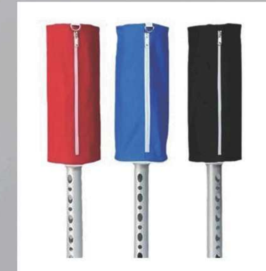
Golf Ball Picker